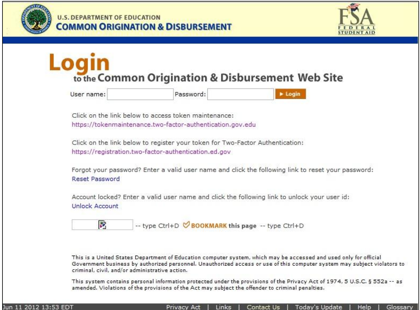
Screenshot #2 - Enhanced COD Web Primary Log-in Page