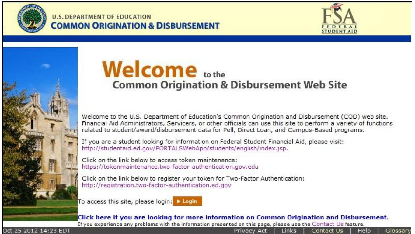
Screenshot #1 - Enhanced COD Web Home Page