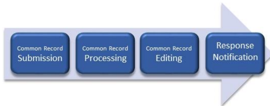
Figure 8: The COD Process

The COD Process is comprised of the following steps: